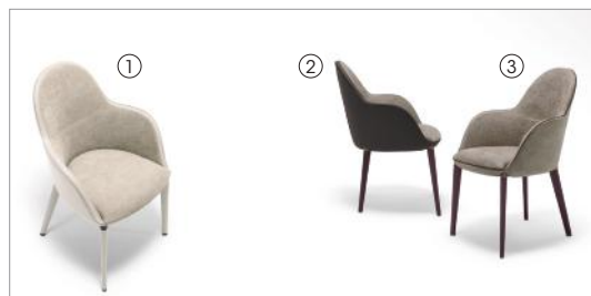
1 Selene 73011 leather 9100/tinto 6511 2 Selene 73011 leather 9122/tinto 6513 3 Selene 73010 leather 9122/tinto 6513