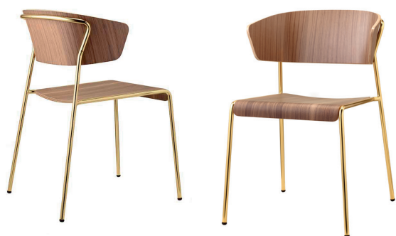
2850 OS NC

AS AWARDED BY THE CHICAGO ATHENAEUM: MUSEUM OF ARCHITECTURE AND DESIGN