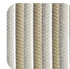
Round Trendy rope Clay-Nut