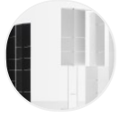
Black or White