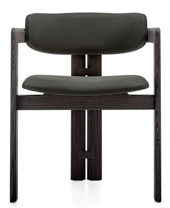
Structure in stained ash Tobacco open pore. Cover in Fard anthracite 2379 Cat. L1.