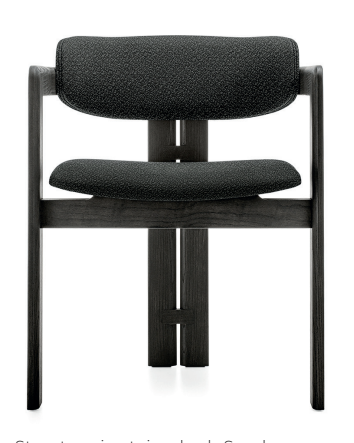
Structure in stained ash Smoke open pore. Cover in Path anthracite 118 Cat. B.