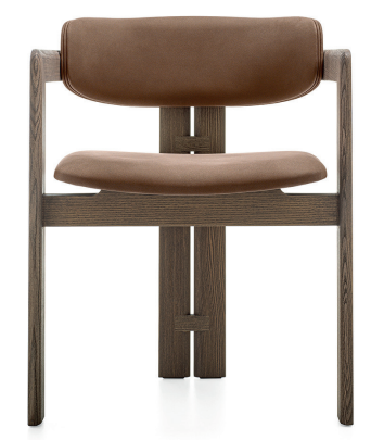
Structure in stained ash Clay poro aperto. Cover in Fard silt 2324 Cat. L1.