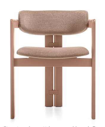
Structure in matt lacquered beech Rosa Jaipur. Cover in Pleasure rose powder 031 Cat. D.