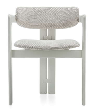
Structure in matt lacquered beech Bianco Camargue. Cover in Maze Ivory 002 Cat. B.