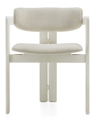
Structure in stained ash White open pore. Cover in Delight cream 109 Cat. A.