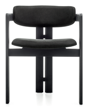
Structure in stained ash Black open pore. Cover in Nabuk black 2138 Cat. L2.