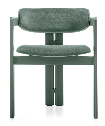
Structure in matt lacquered beech Verde Provenza. Cover in Pleasure aquamarine 003 Cat. D.