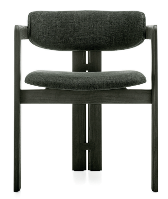
Structure in stained ash Cinder open pore. Cover in Soul silt 027 Cat. B.