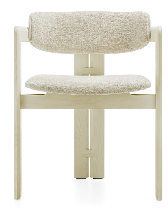
Structure in ash Natural. Cover in Gape ecru 004 Cat.A.