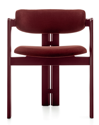
Structure in matt lacquered beech Bordeaux Etruria. Cover in Velvet sienna 014 Cat. A.