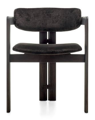
Structure in stained ash Wengè open pore. Cover in Harmony slate 303 Cat. B.