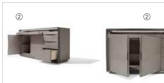
2 Frame 59400 saddle leather dove-grey fin.2B