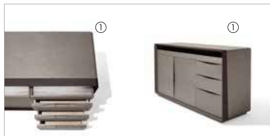
1 Frame 59401 saddle leather tobacco fin.2B