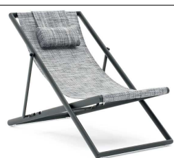
Sdraio pieghevole foldable Deckchair