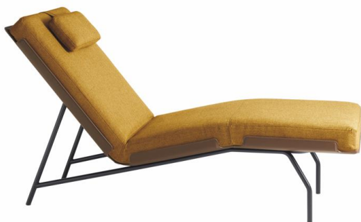
Caruso FG 539.00 Designer: Dainelli Studio

Chaise-longue con scocca in multistrato rivestita in cuoio e materassino imbottito rivestito in pelle o tessuto. Cuscino poggia testa removibile rivestito in pelle o tessuto. Struttura in acciaio verniciato nero opaco.