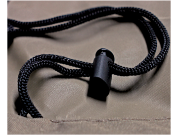
Adjustable rubber band