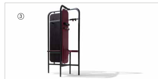
3 Amiral 53715 leather 9118 fin.93