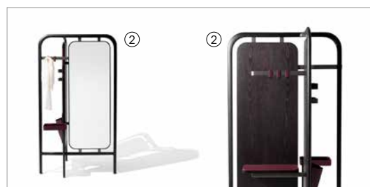
2 Amiral 53715 leather 9118 fin.93