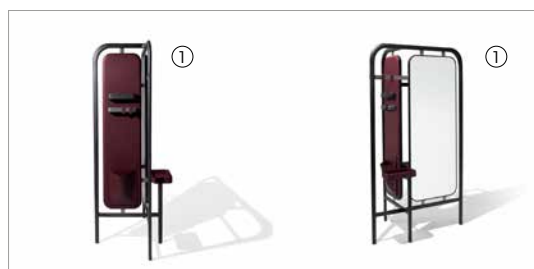
1 Amiral 53715 leather 9118 fin.93