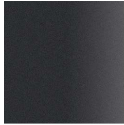
111 FT graphite fine textured