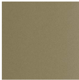
110 FT bronze fine textured