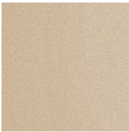
109 FT champagne fine textured