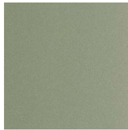
113 FT sage fine textured