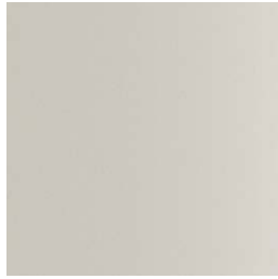
102 FT light grey fine textured