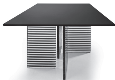
Table with base made of four separate 30 mm DV Glass elements, transparent or with colored stripes. Top made of 15 mm transparent glass, back-lacquered with monochrome color or hand-finished with Ecomalta, finer-grained texture finish.

Tavolo con base composta da quattro elementi in DV Glass da 30 mm trasparente o a strisce colorate. Piano in vetro da 15 mm trasparente retroverniciato con tinte monocromatiche, oppure ricoperto in Ecomalta spatolatura tipo fine.