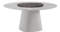
Lazy Susan AC 494.01