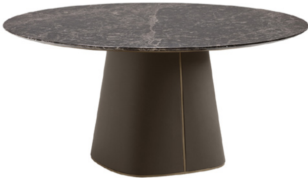
Table with leather-upholstered base and metal details in brushed brass finish. Top in marble (160 cm). Lazy Susan in marble available upon request.

Tavolo con base rivestita in pelle e dettagli in metallo con finitura ottone spazzolato. Top in marmo (160 cm). Su richiesta, vassoio girevole in marmo.