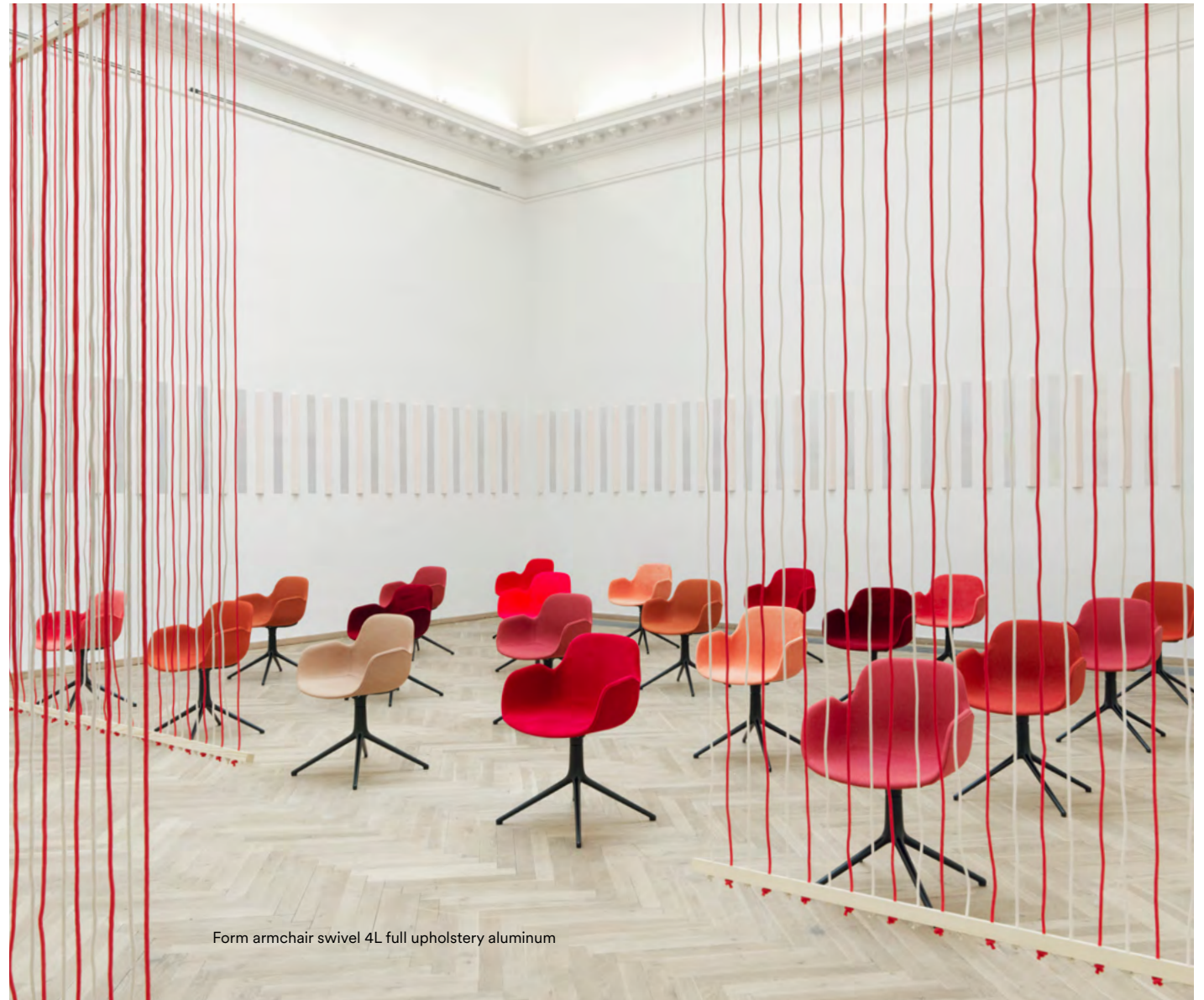
Form armchair swivel 4L full upholstery aluminum

We recommend to check and tighten screws every 3-6 months. Please make sure your choice of glides is suitable for the type of flooring. We recommend to check the glides every 3-6 months. If worn down, please replace.