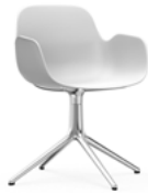
Form armchair swivel 4L H: 80 x L: 70,5 x D: 70,5 x SH: 44 x AR: 66,5 cm