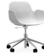
Form armchair swivel 5W gaslift H: 73/86 x L: 72,5 x D: 72,5 x SH: 37/50 x AR: 59/72 cm