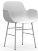
Form armchair steel, chrome, brass H: 80 x L: 56 x D: 52 x SH: 44 x AR: 66,5 cm