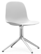
Form chair swivel 4L H: 80 x L: 70,5 x D: 70,5 x SH: 44 cm