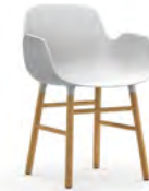
Form armchair wood H: 80 x L: 56 x D: 52 x SH: 44 x AR: 66,5 cm