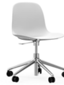
Form chair swivel 5W gaslift H: 73/86 x L: 60 x D: 52 x SH: 37/50 cm