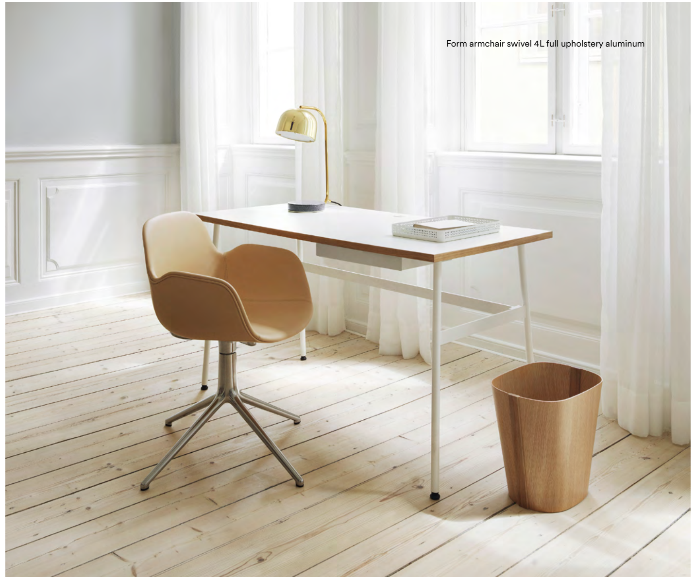
Form armchair swivel 4L full upholstery aluminum

Form tells the story of a design company and a designer with the vision of creating the perfect chair. A tribute to form itself, the uncompromising design combines a strong design idiom with comfortable curves and an innovative industrial technique. The sleek mounting solution developed especially for the Form chair creates a natural integration between seat and base and makes it possible to mount different types of bases in the same openings. While retaining a homogenous and aesthetic design, the Form chair can be customized from more than 100.000 possible combinations of models, colors, textiles and bases, offering a wealth of opportunities for creative expression.