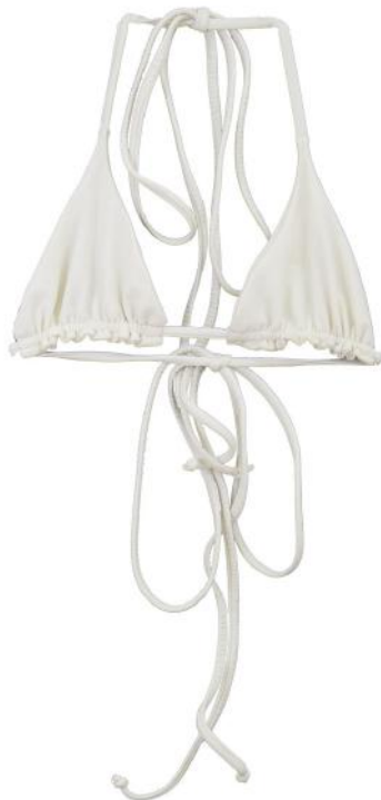
STRING KINI MUSLIN (BONE)