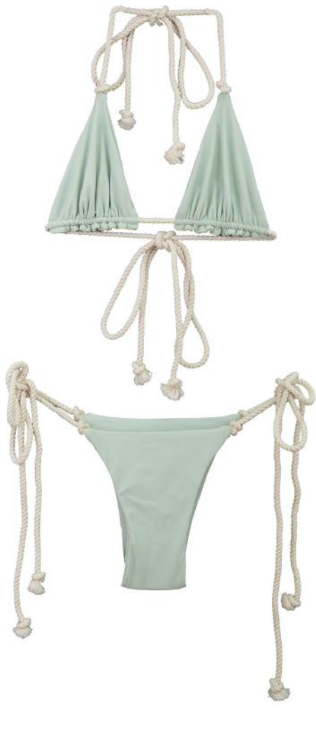
ROPE KINI SAGE