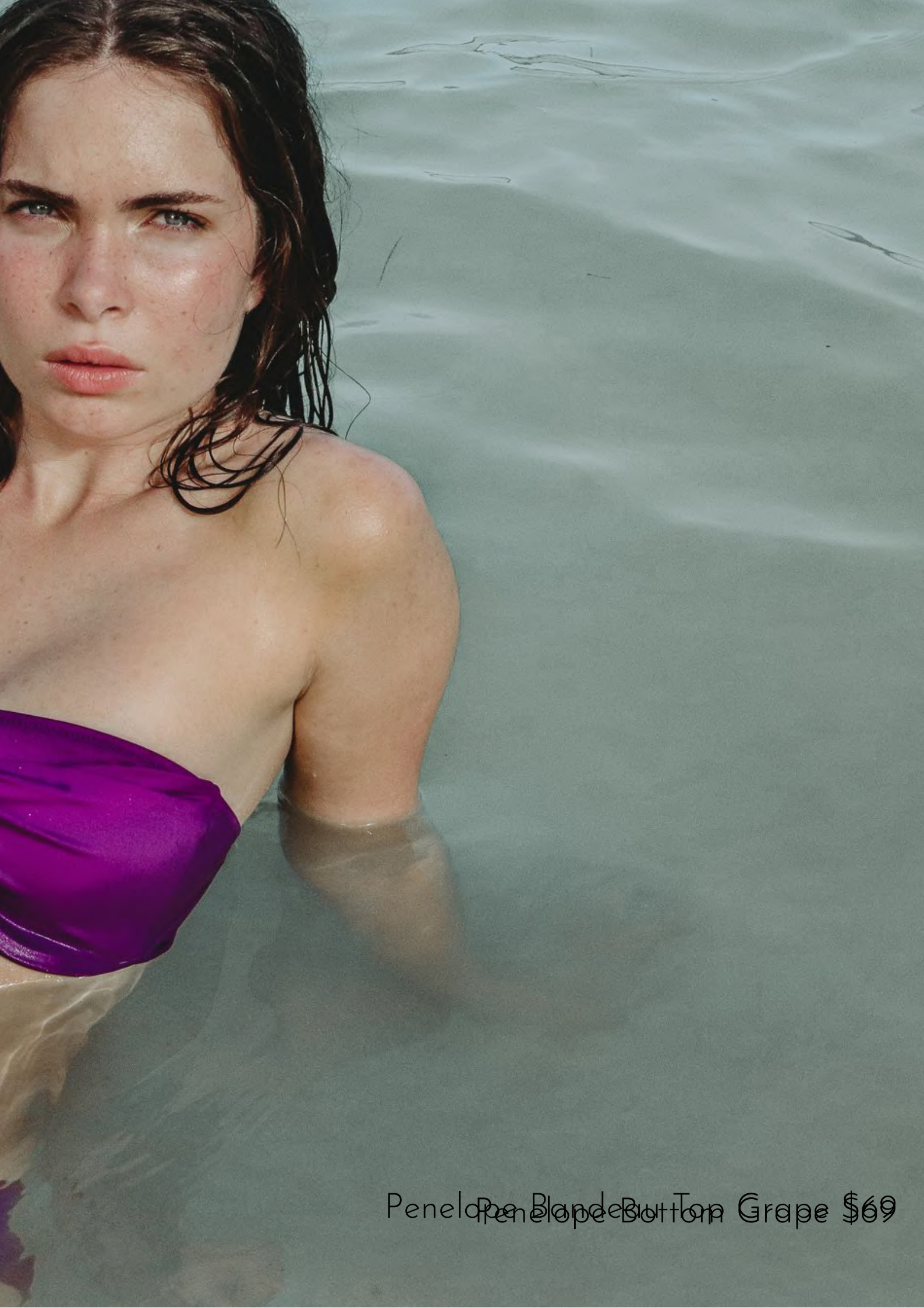
Penelope Blande Button Grape $69