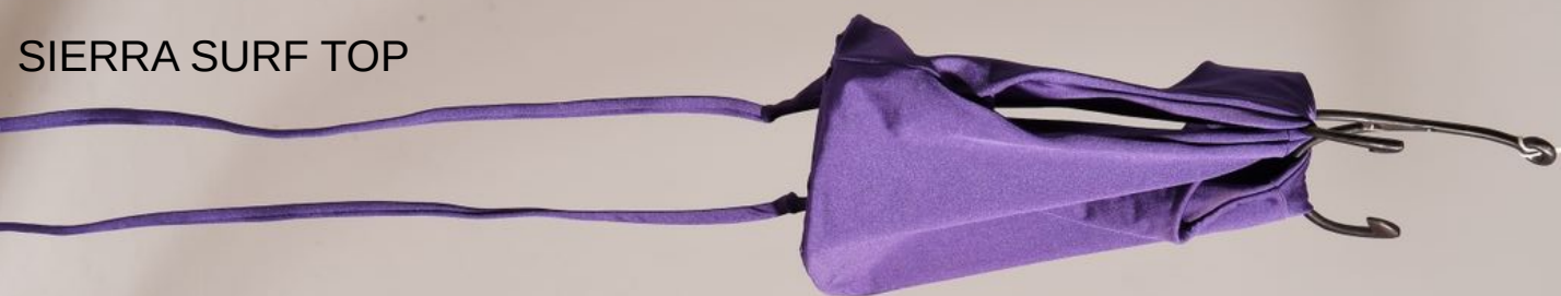
SIERRA SURF TOP