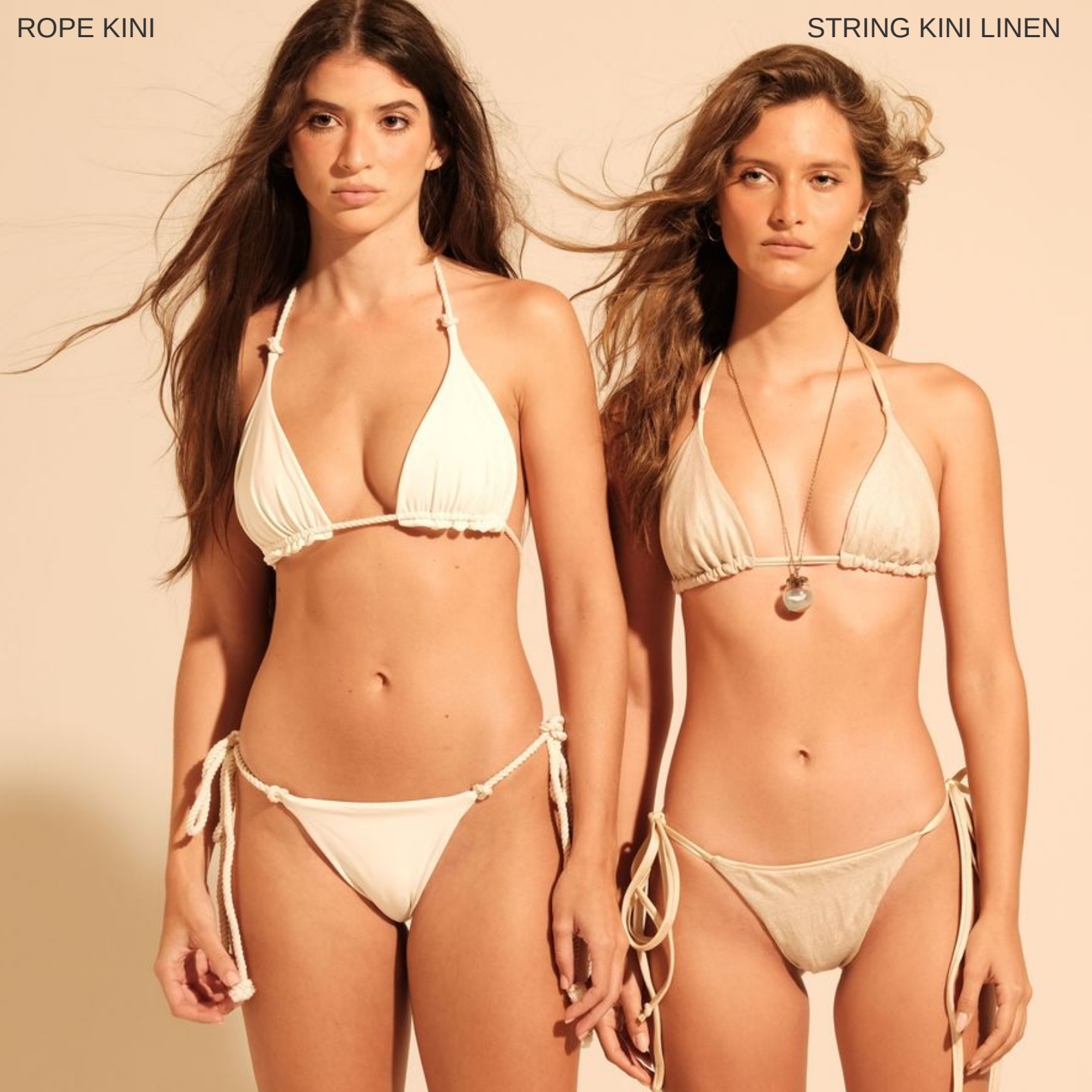
STRING KINI LINEN