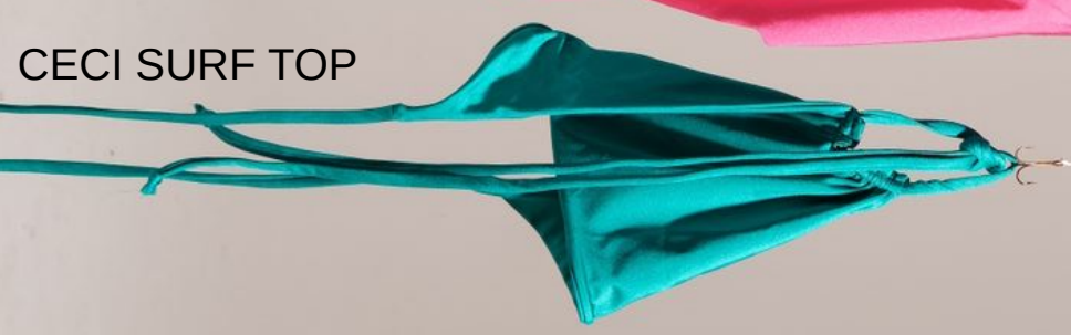
CECI SURF TOP