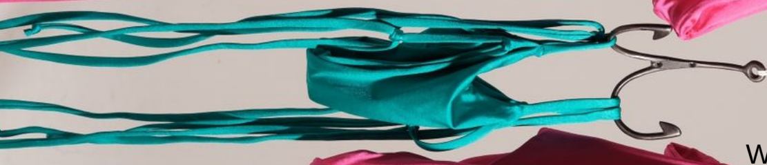
DOUBLE BOW BOTTOM