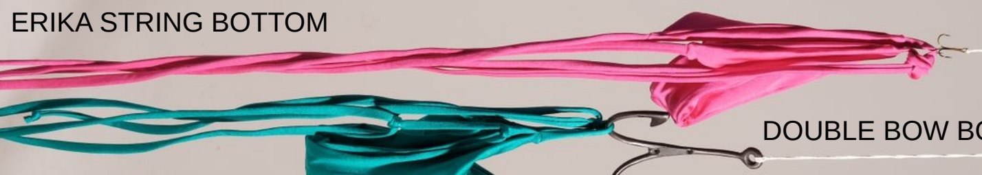
ERIKA STRING BOTTOM