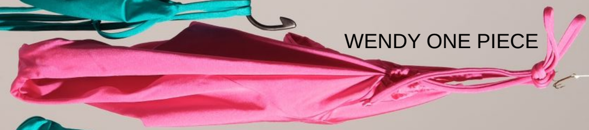
WENDY ONE PIECE