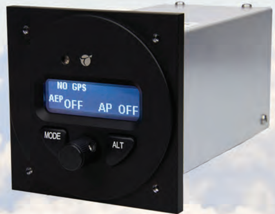
Vizion - 3 1/8 round 3.4" H x 3.4" W x 5.4" D Weight - 10 oz Volts - 12 to 28