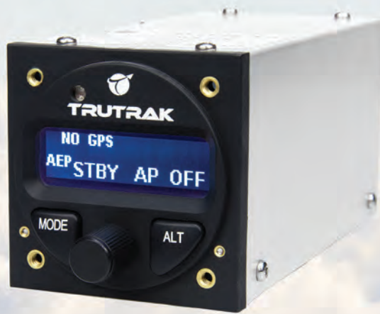
Vizion - 2 1/4 round 2.5" H x 2.5" W x 5.4" D Weight - 10 oz Volts - 12 to 28