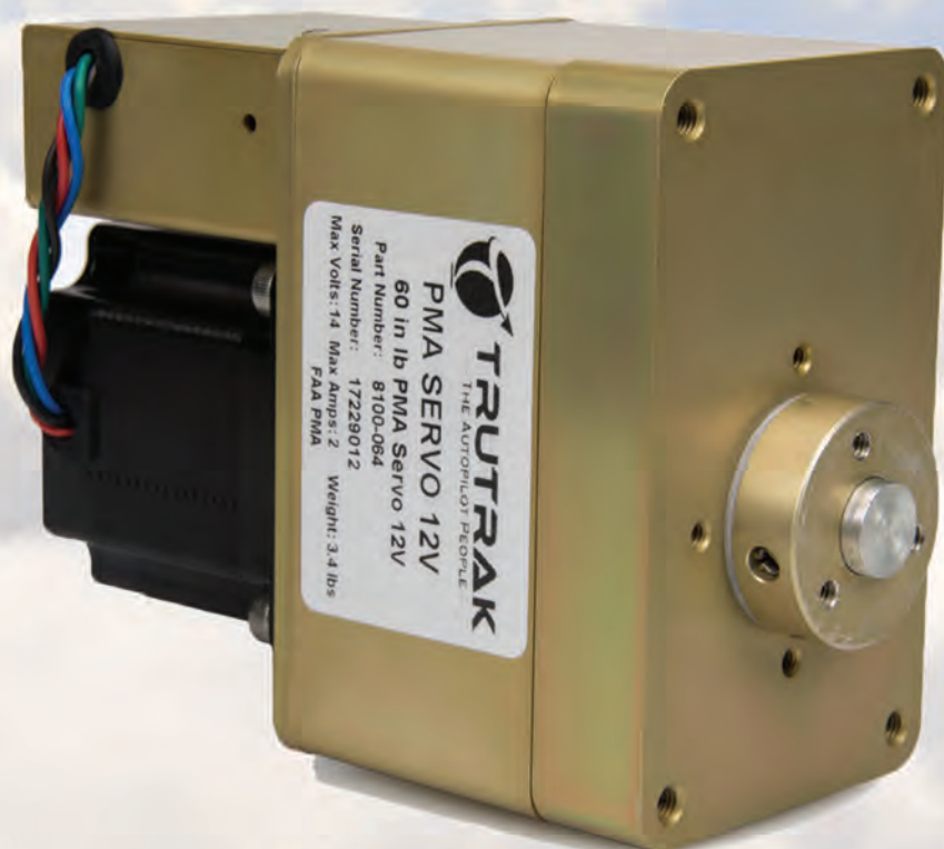
60 In-lb Servo

Trutrak offers a range of servo torque outputs and 12 volt or 24 volt options to meet the requirements of each aircraft covered under our STC. Our servos are designed with safety and durability in mind. Features include limited torque by an internal slip clutch, a disengage clutch, and an all metal gear train. It should also be noted that our servo design is free from any potential software errors because software is not used inside the servo. These features combine to create a servo that can be overridden in flight, and ensures that it is not capable of the many dangerous things that other manufacturers autopilot servos are known to do. For example, a hard over runaway is not possible, because the servo commands use a complex waveform in unison with limited torque capability.