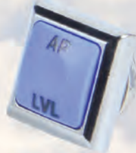
Emergency Level Button