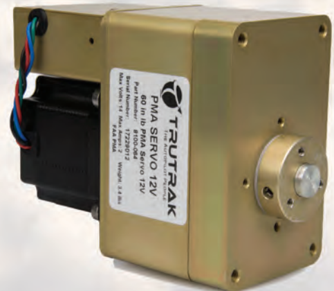
PMA - Servo 4" H x 2.5" W x 5" D Weight - 3.4 lb Volts - 12 or 24