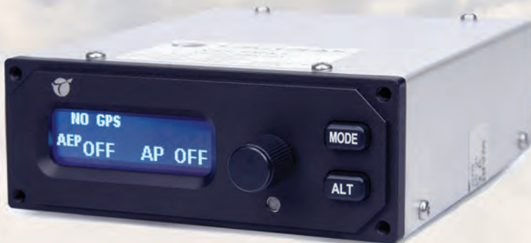
Vizion - Flat Pack 1.6" H x 4.3" W x 6.1" D Weight - 10 oz Volts - 12 to 28