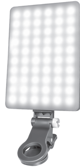
Clip-on Snap Light