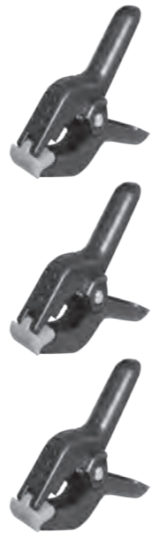
3X Holding Clamps