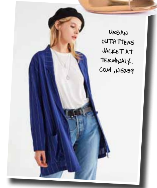
URBAN OUTFITTERS JACKET AT TERMINALX.COM, NIS259

THE LATEST ESSENTIALS FOR YOUR FACE, SKIN AND BODY: