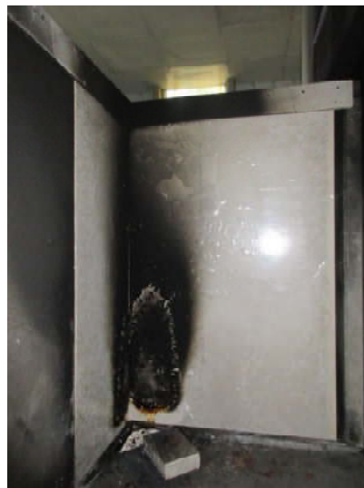
After Test (EN 13823)