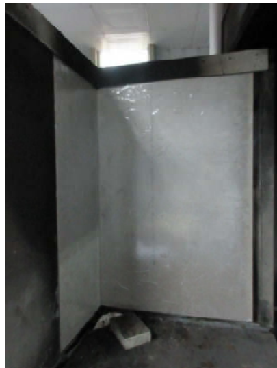
Before Test (EN 13823)

Density of the test specimen: About 118 g/m 2