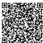
Agrozen Laboratory Authenticity QR Code