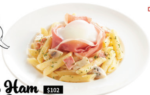
Parma Ham Penne Carbonara $102 with Onsen egg 意大利巴馬火腿卡邦尼長通粉配温泉蛋