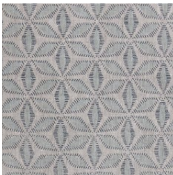
BLIN16.013 LIGHT BLUE Oatmeal Linen