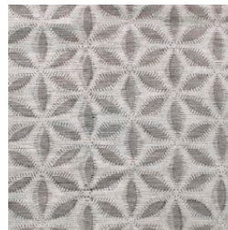
BLIN16.011 MUD Oatmeal Linen