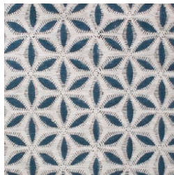
BLIN16.010 PACIFIC BLUE Oatmeal Linen