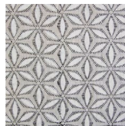
BLIN16.012 CHALK Oatmeal Linen