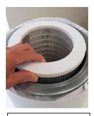
5. REMOVE THE HEPA FILTER