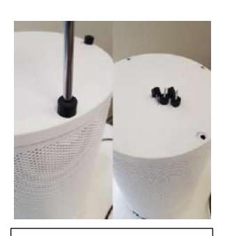
3. USING A SCREWDRIVER REMOVE THE 4 SCREWS