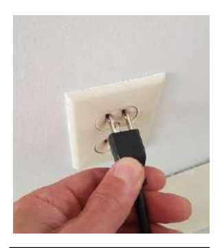
1. UNPLUG THE UNIT