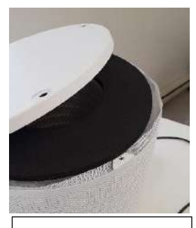
4. REMOVE THE BOTTOM COVER AND THE FOAM GASKET