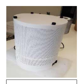
2. LAY THE UNIT UPSIDE DOWN ON A FLAT AND CLEAN SURFACE