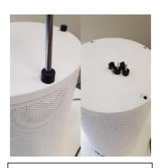
3. USING A SCREWDRIVER REMOVE THE 4 SCREWS