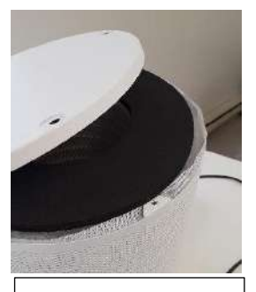
4. REMOVE THE BOTTOM COVER AND THE FOAM GASKET