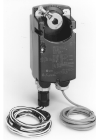
Figure 1: M9206 Electric Spring Return Actuator

The M9206 models deliver 53 lb-in (6 N-m) of torque. The angle of rotation is mechanically adjustable. Integral line voltage auxiliary switches are available to indicate end-stop position or to perform switching functions within the selected rotation range. Position feedback is provided on proportional models through a proportional DC voltage signal.