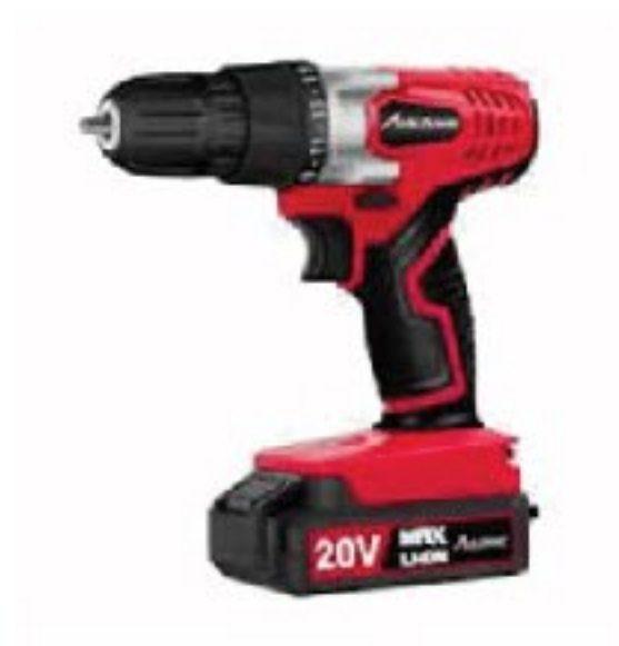
Cordless Drill Needed to remove 12 wood screws.