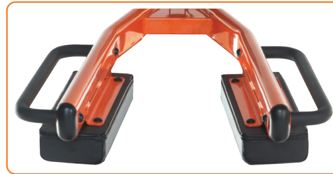
TAPERED SHOULDER PADS & LONG HAND RAILS