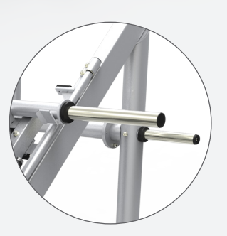
Extended Weight Bar for Heavy Loads