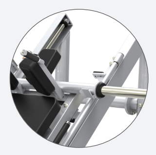
Guided motion and safety locking points eliminate the need for a spotter.