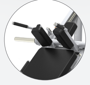
Case hardened rods and high quality bearings ensure smooth performance at any weight.