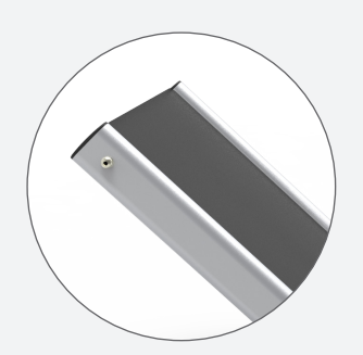
Extra Wide Foot Plate