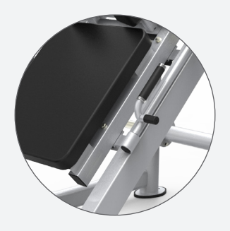
Super-smooth movement up and down the carriage.