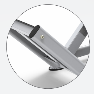
Ergonomically designed oval, 11 gauge steel that gives the CF2175 a modern look and superior stability.