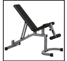
Flat Incline Decline Bench