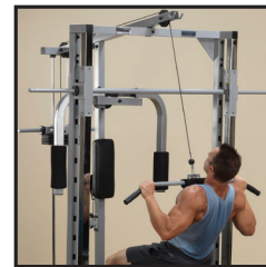
Lat Row Station