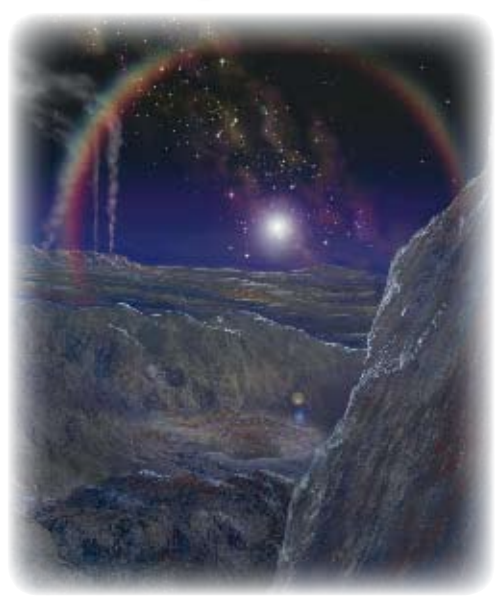
An artist's impression of the sun seen from Quaoar

You've probably stood back-to-back with a friend or family member to see who's taller. Scientists sometimes measure objects in space by comparing the objects to things that are behind them.