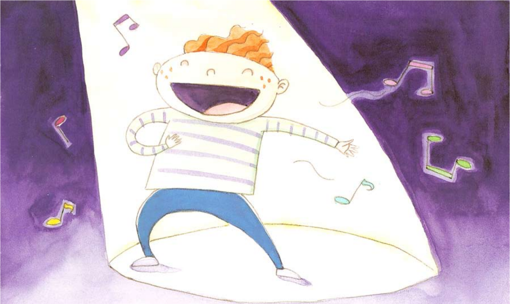
Sid, Sid, the sing-song kid.