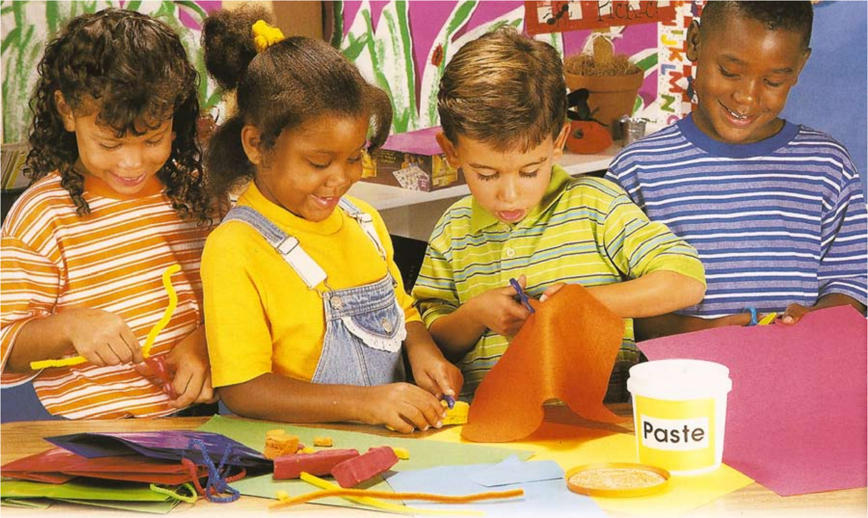
The kids cut.