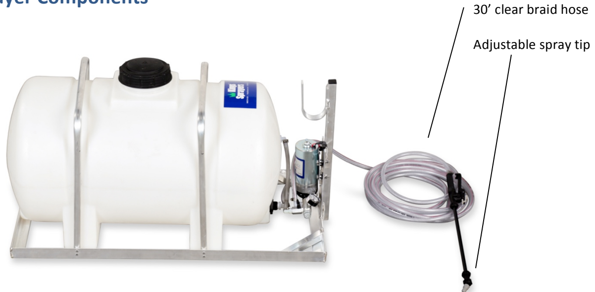
Figure 1: Side View