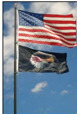
Attach your second flag to the second set of clips.