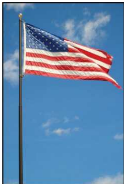
Attach your flag to the top set of stainless steel clips.

Flying one flag, two flags, and flying one flag at half mast is simple.