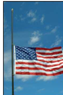
Fly your flag at half mast by removing the second flag, and attaching the flag to the second set of clips.