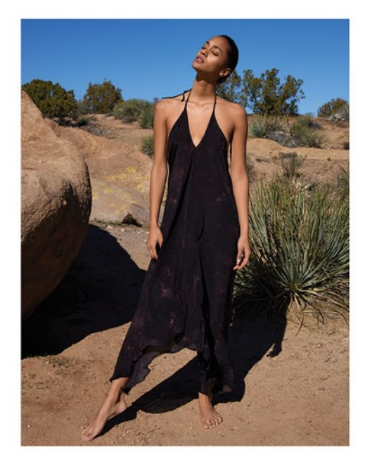
RHODES DRESS IN TIE DYE PRINT SILK IN BITTER CHOCOLATE