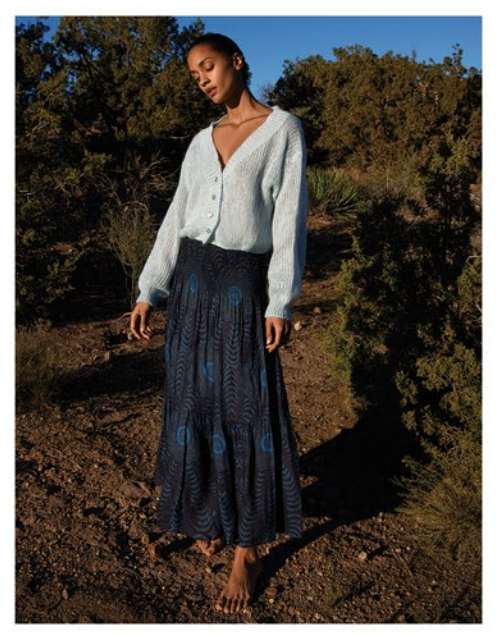
GAIA MAXI SKIRT IN AFRICAN Peacock print in Midnight