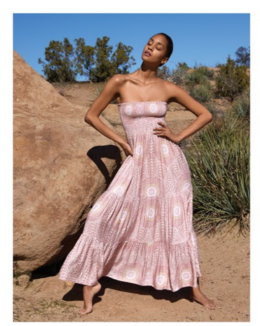
GAIA DRESS IN AFRICAN PEACOCK Print in antique pink