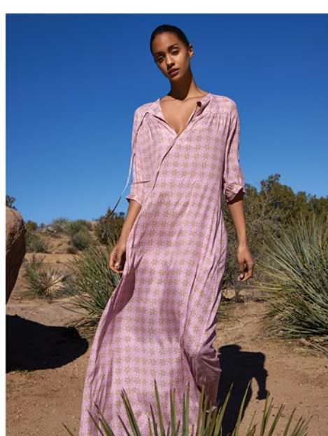
MAIA DRESS IN VINTAGE PETAL PRINT IN ANTIQUE PINK