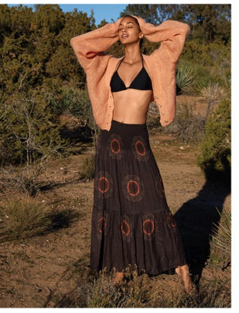
GAIA MAXI SKIRT IN AFRICAN Peacock print in bitter Chocolate