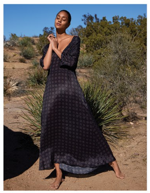
MAIA DRESS IN VINTAGE PETAL PRINT IN BITTER CHOCOLATE