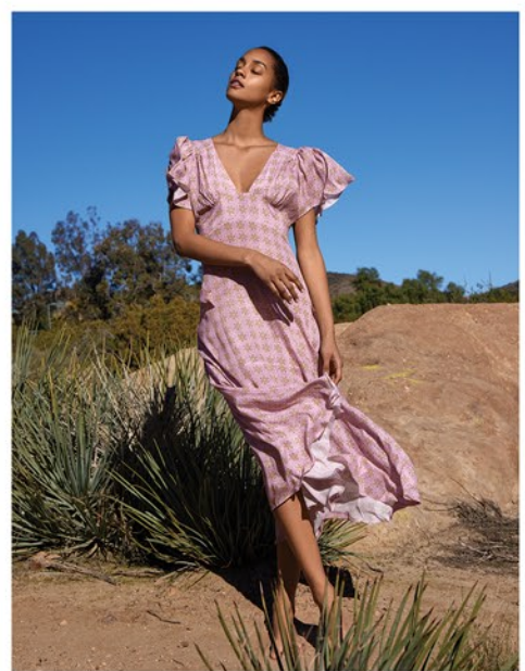
IRIS TEA DRESS IN VINTAGE PETAL PRINT IN ANTIQUE PINK