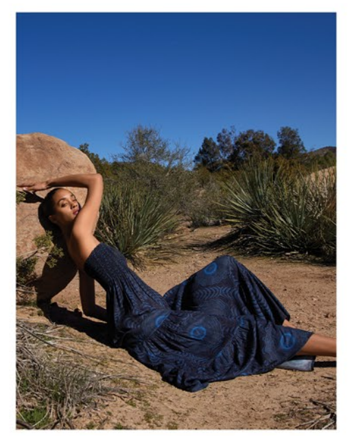
GAIA DRESS IN AFRICAN PEACOCK Print in Midnight