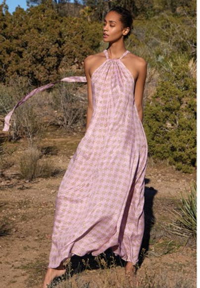
HEBE DRESS IN VINTAGE PETAL PRINT IN ANTIQUE PINK