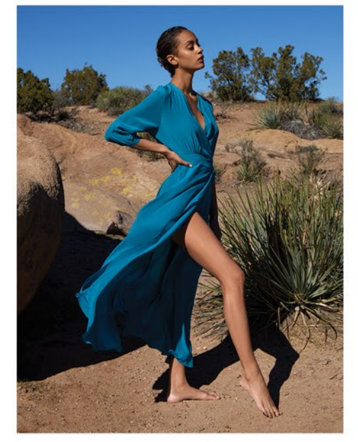
ATHENA DRESS IN BLOCK SILK IN KINGFISHER BLUE