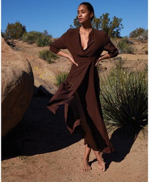
ATHENA DRESS IN BLOCK SILK IN CLOVE