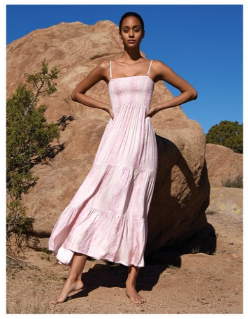
GAIA DRESS IN DELICATE SNAKE Print in Dusty Pink