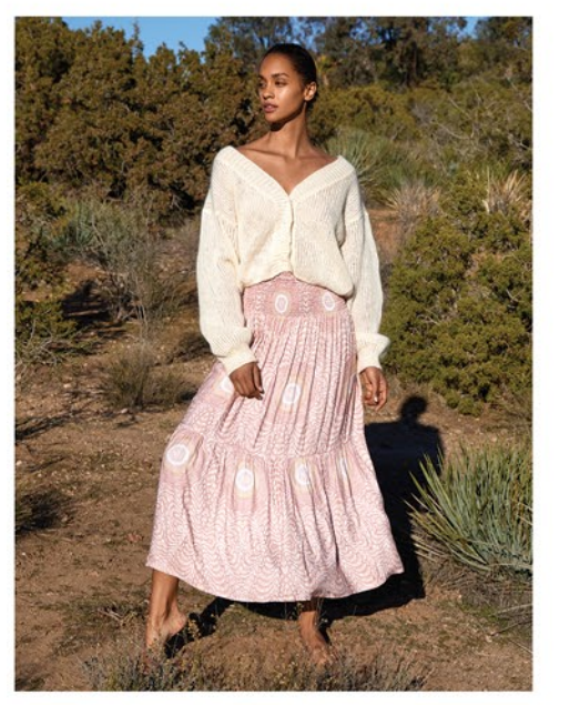
GAIA MAXI SKIRT IN AFRICAN Peacock print in antique pink