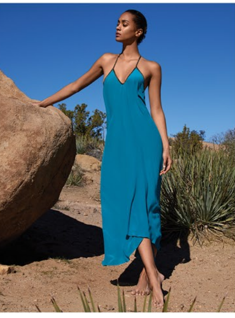
RHODES DRESS IN BLOCK SILK IN KINGFISHER BLUE