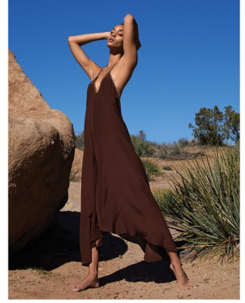
RHODES DRESS IN BLOCK SILK IN CLOVE