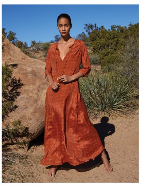
MAIA DRESS IN VINTAGE PETAL PRINT IN BURNT SIENNA