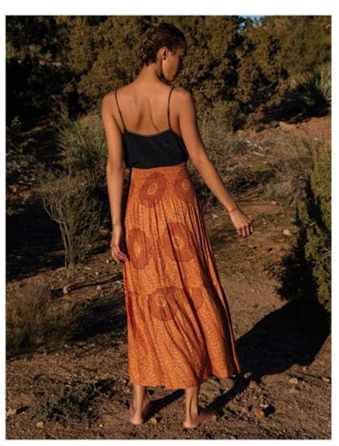
GAIA MAXI SKIRT IN AFRICAN Peacock print in burnt sienna