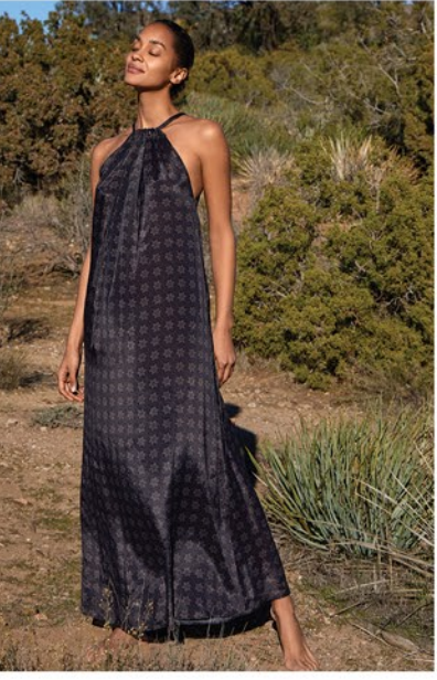
HEBE DRESS IN VINTAGE PETAL PRINT In Bitter chocolate