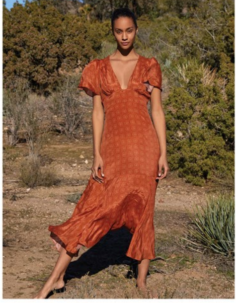
IRIS TEA DRESS IN VINTAGE PETAL PRINT IN BURNT SIENNA