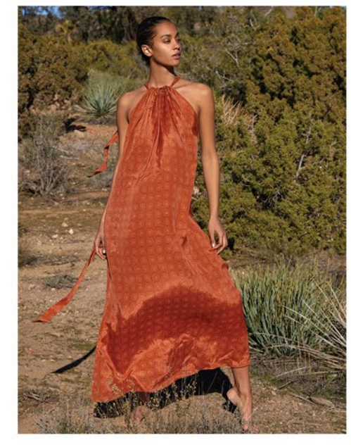
HEBE DRESS IN VINTAGE PETAL PRINT IN BURNT SIENNA