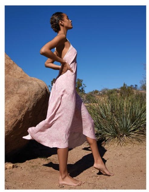
RHODES DRESS IN BALINESE Feather print in dusty pink