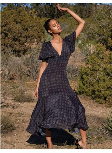
IRIS TEA DRESS IN VINTAGE PETAL PRINT IN BITTER CHOCOLATE