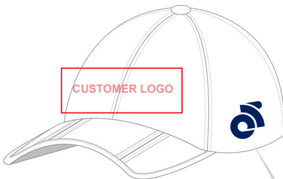
Standard Manufacture Logo