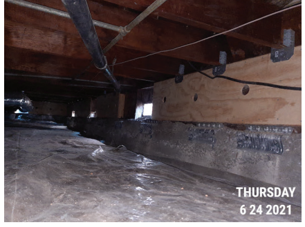
CRAWL SPACE POST-RETROFIT #2