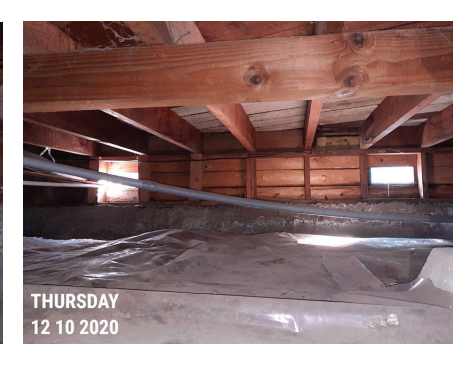
CRAWL SPACE PRE-RETROFIT #3