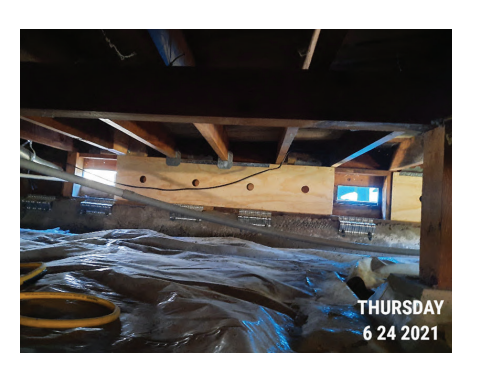
CRAWL SPACE POST-RETROFIT #3