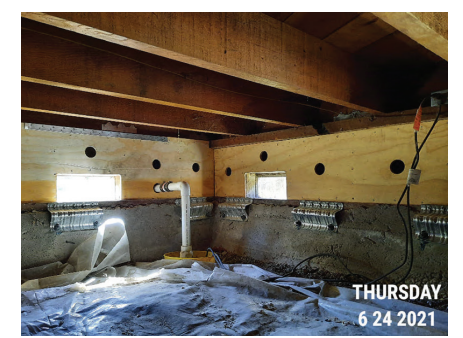
CRAWL SPACE POST-RETROFIT #1