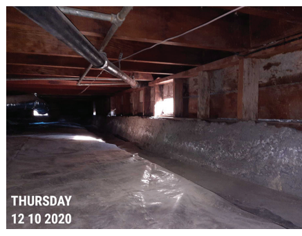
CRAWL SPACE PRE-RETROFIT #2