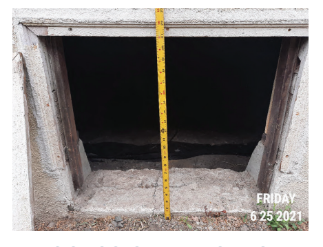
ACCESS CRAWL SPACE (show scale with something such as a ruler)