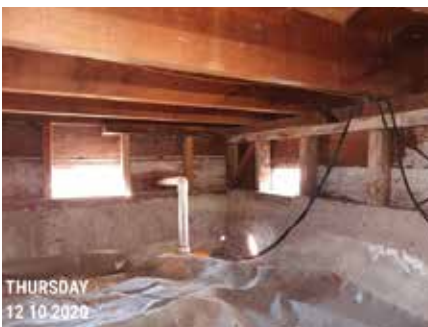
CRAWL SPACE PRE-RETROFIT #1