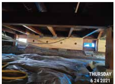
CRAWL SPACE POST-RETROFIT #3