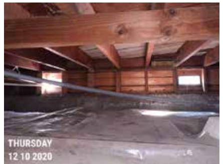
CRAWL SPACE PRE-RETROFIT #3