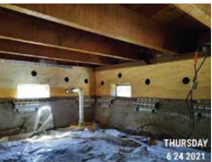
CRAWL SPACE POST-RETROFIT #1