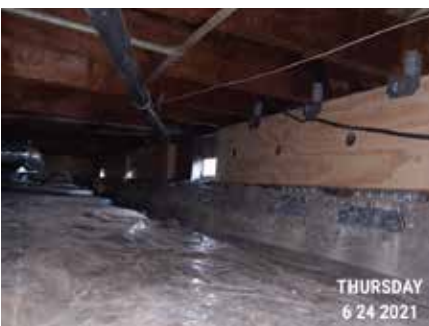
CRAWL SPACE POST-RETROFIT #2