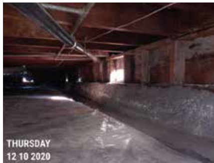
CRAWL SPACE PRE-RETROFIT #2