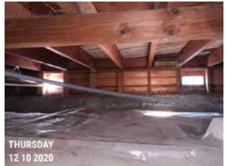
CRAWL SPACE *If applicable

*Note: House View examples are to demonstrate the angles at which the photos should be taken. All ESS houses must have a living space above the garage.