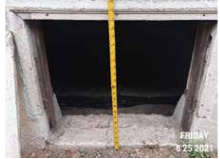
ACCESS CRAWL SPACE (show scale with something such as a ruler)