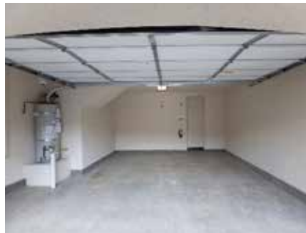
GARAGE** PRE-RETROFIT #2