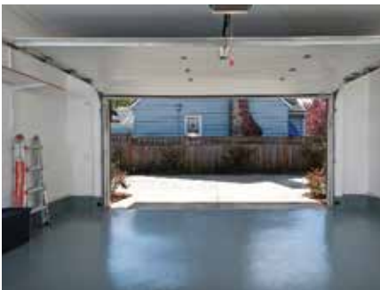
GARAGE** PRE-RETROFIT #1