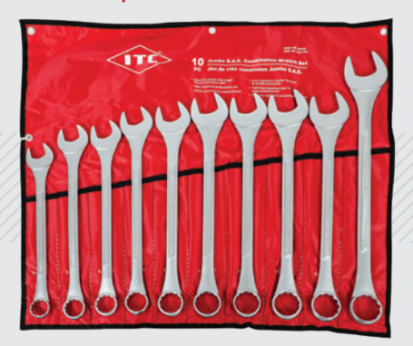
020202 | 10-PC Jumbo SAE