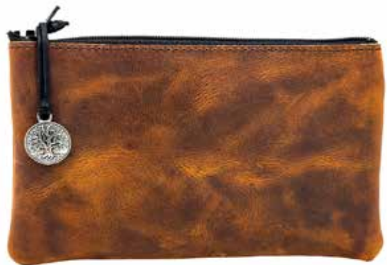
Hard Times Copper Zipper Pouch