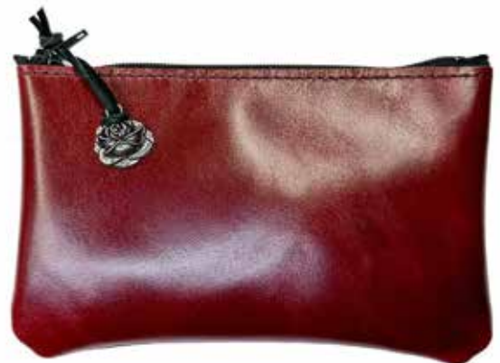
Leather 6 inch Zipper Pouch in Garnet