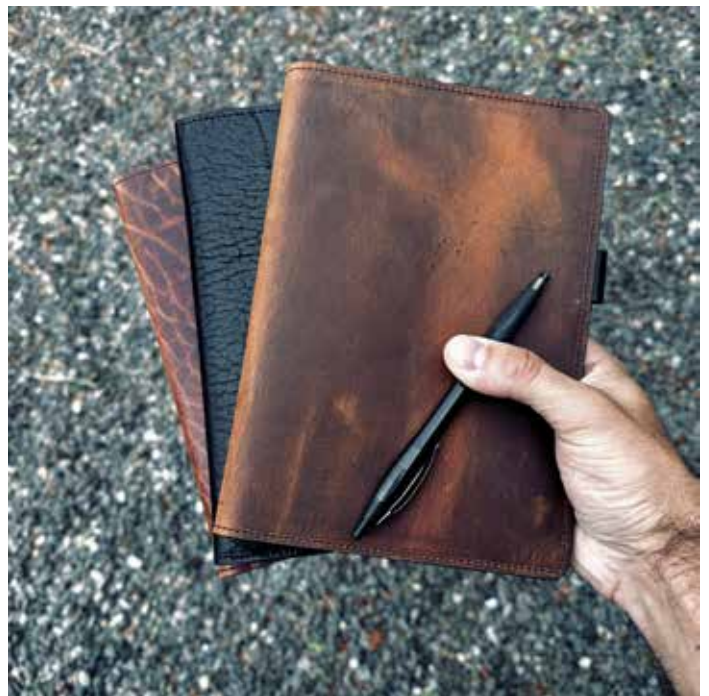
Small Notebook Portfolios in Rustic Leathers

A beautiful vintage tanned leather with a matte finish that changes with each bend and flex, pulling up a lovely copper color and creating a look totally unique to you. We love the patina this leather gets over time!