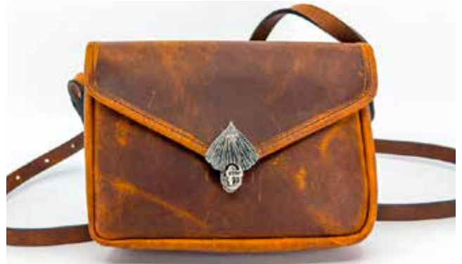
Becca in Hard Times Leather

Lightweight and portable with an easily accessible exterior back pocket for your phone and interior pocket for an I.D. and credit card.