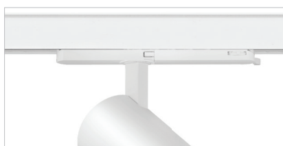
Concealed Track Mounted Driver