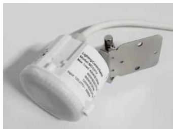
Optional microwave motion sensor Part: MTS15