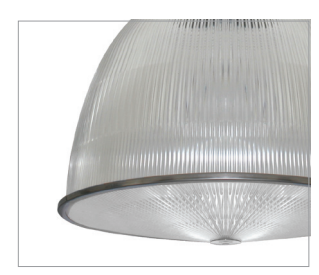
Prismatic Diffuser Option