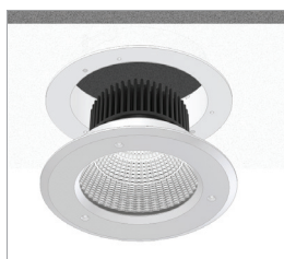
Concealed Recessing Ring