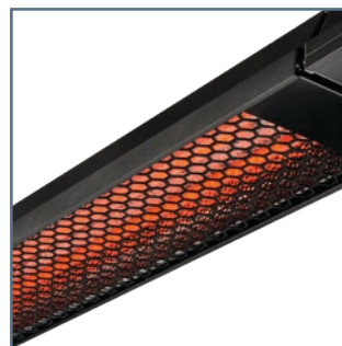
Anodised alloy components provide corrosion protection, also suitable for coastal locations.