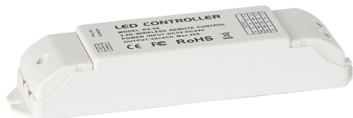
Must be used with HV9103-R4-5A